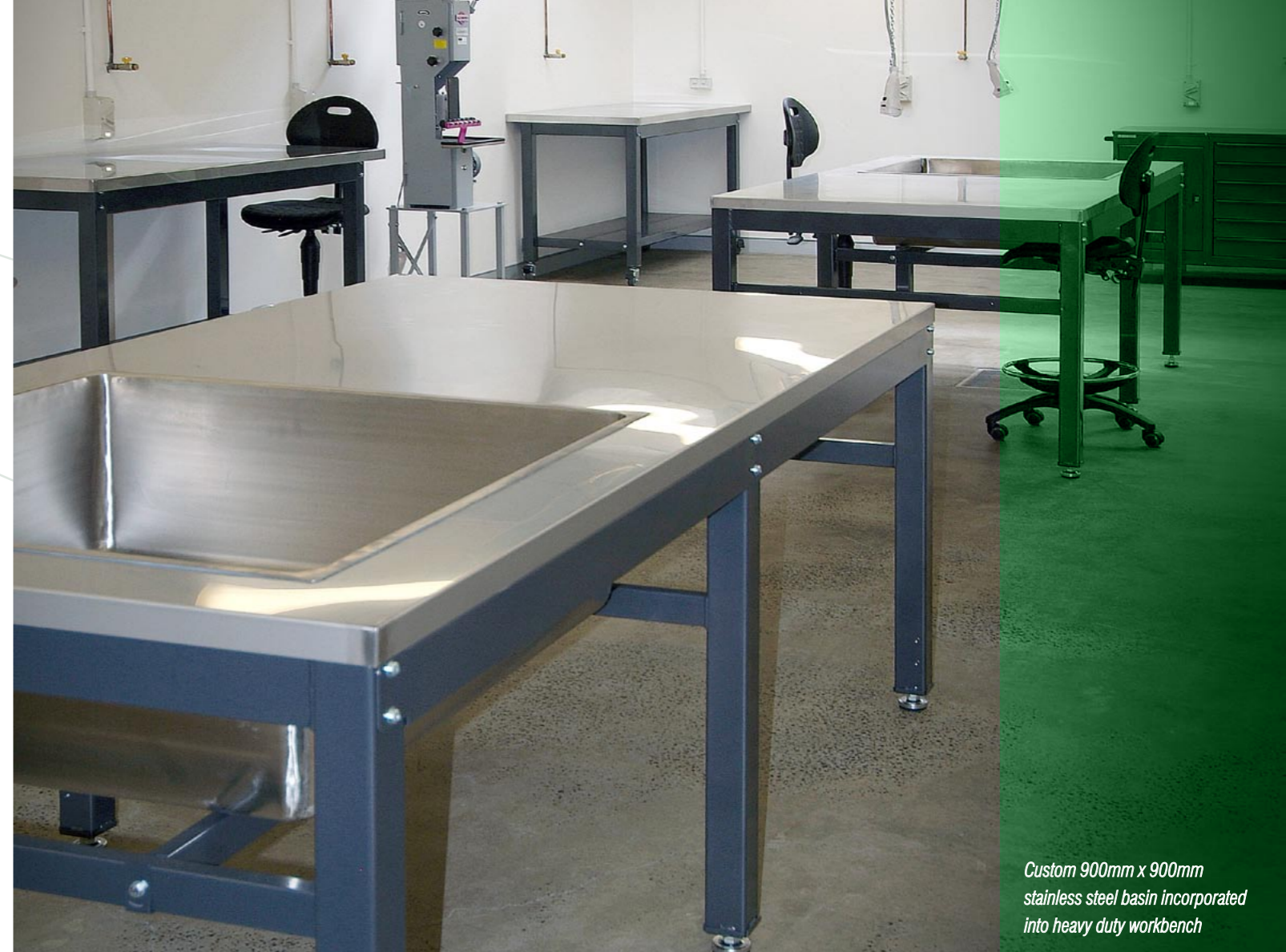
Custom 900mm x 900mm stainless steel basin incorporated into heavy duty workbench

Boscotek's design studio modified the heavy duty workbench design to accommodate a large 900mm x 900mm stainless steel basin mounted within an oversize 2300mm x 1200mm workbench with stainless steel top.