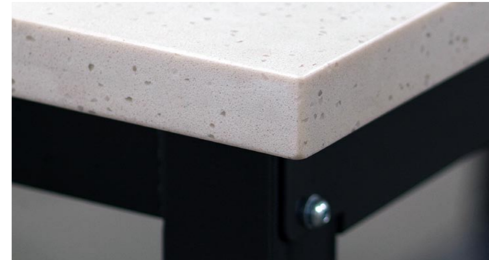
Caesar Stone workbench top

40mm thick Caesar Stone bench tops were also incorporated into current heavy duty workbench models. The thick tubular steel frame offers the ideal support for the heavy stone material, with its 1 tonne load capacity. Caesar Stone provides one of the cleanest and safest work surfaces to work from, which is critical to the success of the glass casting and fusing manufacturing process.