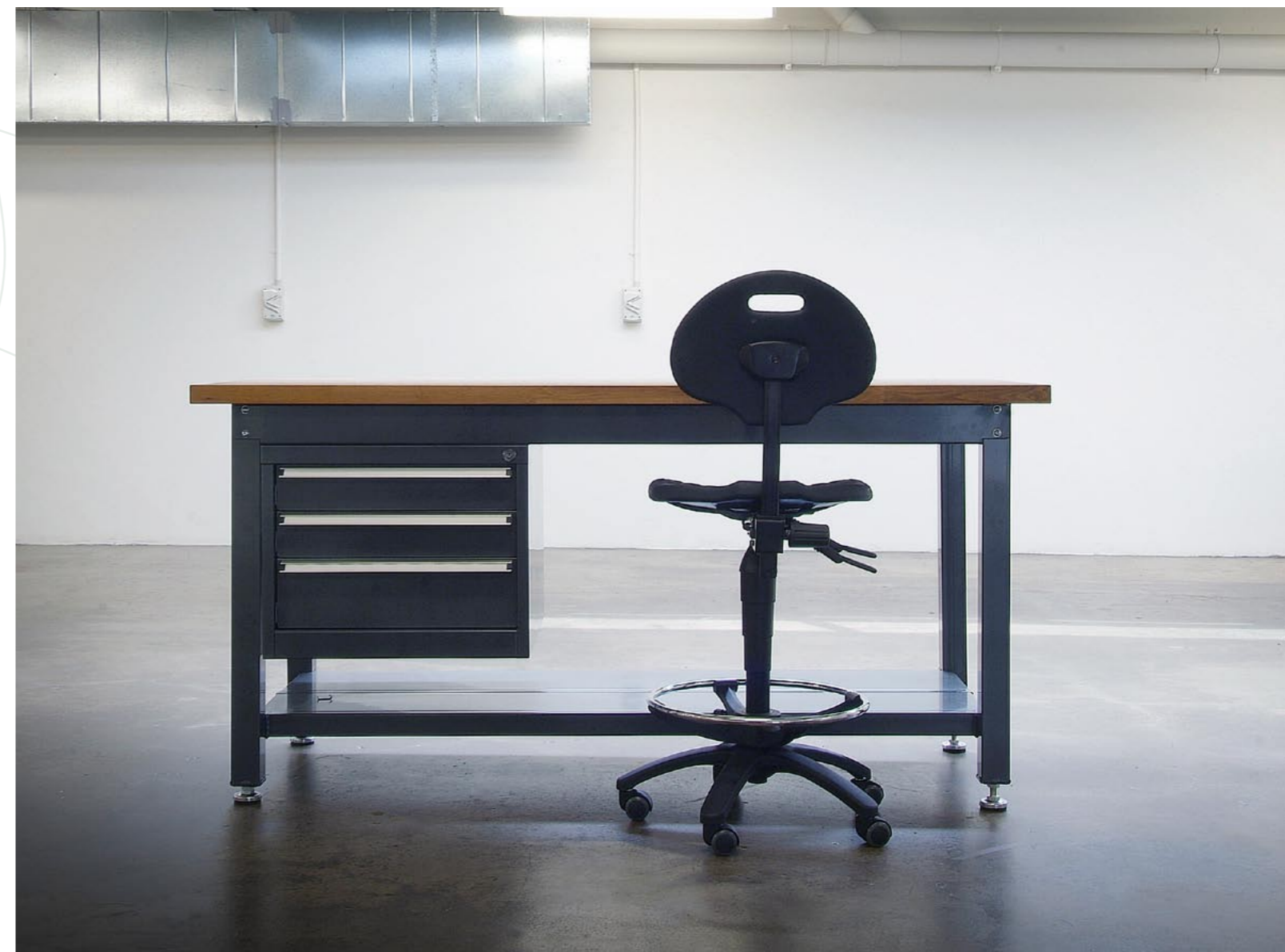
WBH.918.B17 heavy duty workbench with oak top

Contact Boscotek for your next workshop storage installation or upgrade.