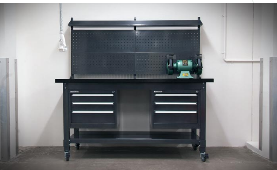
WBH.918.B12.T6 heavy duty workbench with mild steel top, under shelf and castors