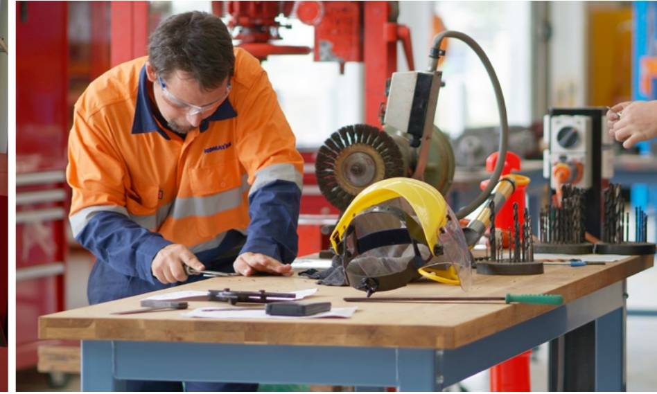
BELOW: Heavy duty workbench with oak bench top LEFT: Heavy Vehicle Training Workshop