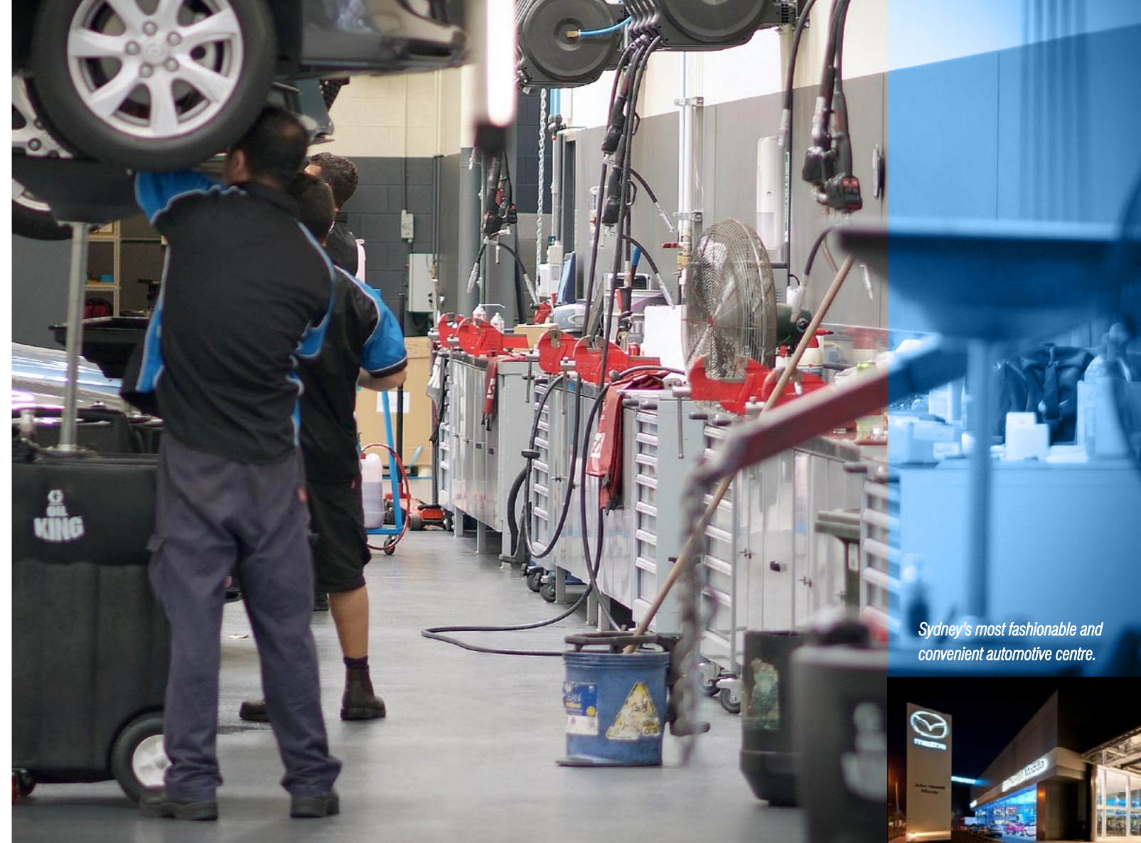
Sydney's most fashionable and convenient automotive centre.

Repair and maintenance turn around time is a key element to achieving a superior customer service experience. Efficient and organised tool storage plays an integral part to this outcome, so Boscotek high density industrial drawer storage cabinets were selected to compliment the modern 25 bay automotive workshop facility.