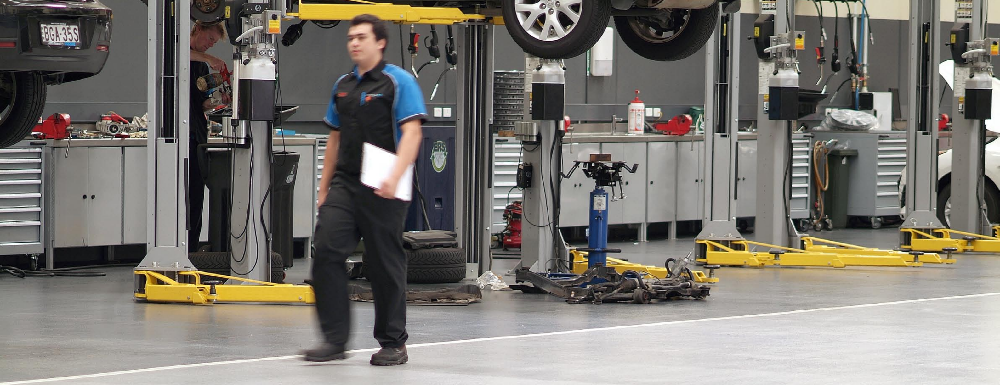
Each mobile drawer storage cabinet provided each technician with a secure, efficient and heavy duty drawer storage solution, storing everything from hand tools to hardware.